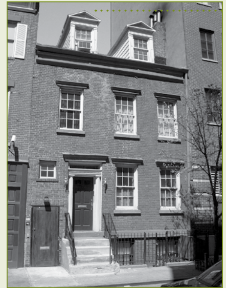
7 Leroy Street, one of 13 federal houses proposed for landmark designation by GVSHP