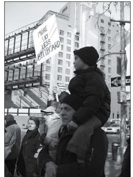
Residents rally at GVSHHP's anti-billboard demonstration

of the two planned billboards, and in order to do so he would have to either remove all illumination or move the sign to face several feet closer to the hotel's windows. We have urged the owner not to erect the billboard rather than do that, but he has thus far refused. However, we continue to seek a ruling from the City on two other bases upon which we believe the billboard is illegal—bases which would be much more difficult to correct. We continue to plan protests and boycotts until the signs are removed. For more information or how to help, see www.gvshp.org/GansvBlbd.htm .