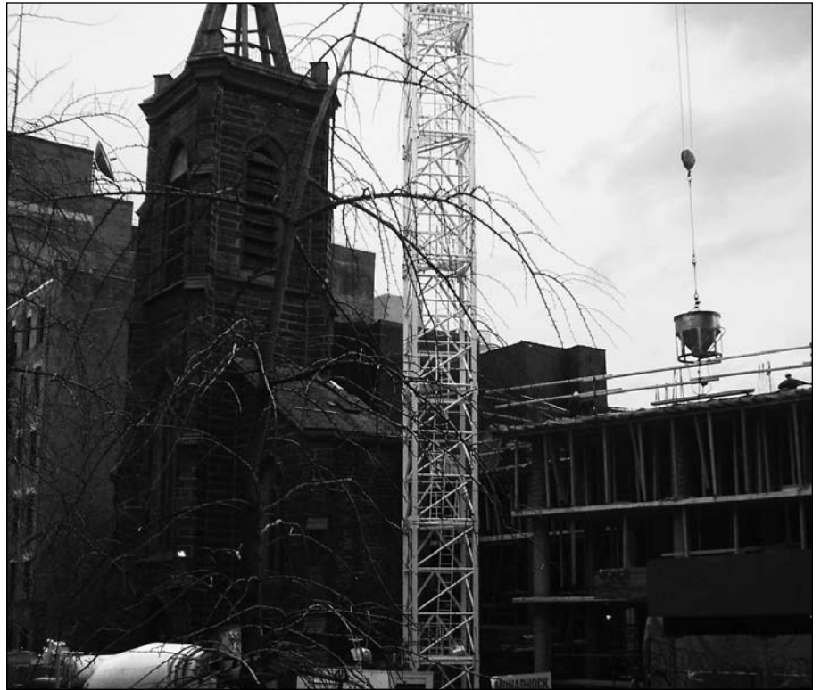
NYU's dorm will rise to 262 feet above the former tower of St. Ann's church

On other fronts, GVSHP was also greatly disturbed to hear that NYU was continuing to shut down facilities in the Financial District and relocate them to our neighborhood. It has recently come to light that, as a result, NYU plans to build yet another 600-800 bed dorm somewhere in our neighborhood, though they have refused to provide any information about sites under consideration. We have informed NYU and city officials that we find this unacceptable. Instead, we are calling for