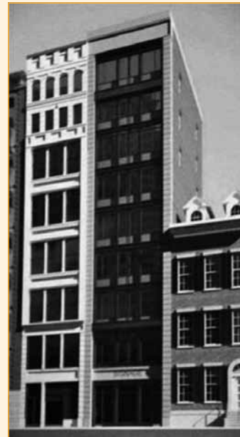
Proposed 9-story hotel at 27 E. 4th Street (l.), next to Merchant's House (r.).