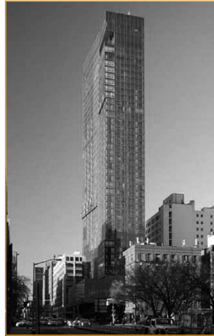
The rezoning failed to deliver on promises to prevent more Trump SoHo’s.

While GVSHP does not oppose residential uses in Hudson Square, due to the extreme desirability and profitability of residential development in Manhattan, this new allowance necessarily means significantly increased development in an area already suffering from some of the worst traffic in the region, and a glaring lack of infrastructure such as recreational space. GVSHP argued that if incredibly lucrative