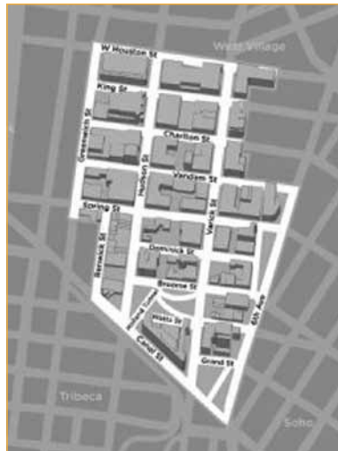
Map of Hudson Square Rezoning boundaries.

In 2006, GVSHP opposed construction of the Trump SoHo in Hudson Square. While the area’s zoning allowed new development of the enormous size and height of the planned tower, it prohibited new residential or ‘residential hotel’ construction, which the “condo-hotel” hybrid clearly was. GVSHP fought vociferously against the project, but ultimately it was given permits by the City, with the support of City Council Speaker Quinn and Borough President Stringer. They argued that the development was allowed by the zoning because it was a “transient” or traditional hotel, in which guests did not live there but rather stayed for limited periods of time. They were unconvinced by Trump’s own ads proclaiming the development a “residence.”