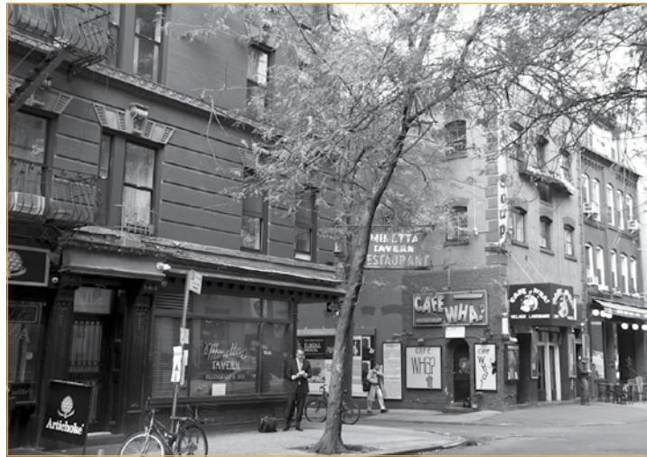
The corner of Minetta Lane and MacDougal Street, within the new proposed South Village Historic District.

GVSHP has waged a concerted advocacy campaign to landmark this area, including