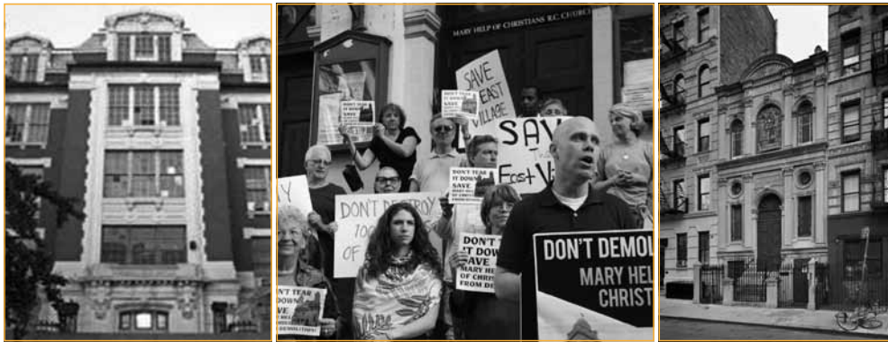
Old P.S. 64 (l.), GVSHP and allies rally to save Mary Help of Christians Church (m.), and Mezritch Synagogue (r.); credit: Barry Munger).

In 2008, GVSHP and allies stopped a plan to demolish this historic synagogue, a mini architectural tour-de-force and the last operating tenement synagogue in the East Village, and pushed for landmark designation of the building. In 2013, it was included in the new East Village/Lower East Side Historic