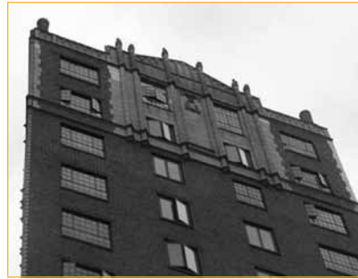
NYU's Brittany Dorm, mid-renovation; casement windows, which matched the neo-Gothic design, were ripped out and replaced with modern single-pane windows. All the old windows were eventually removed.

Finally, when NYU sought approvals for its massive expansion plan, it promised that it was putting all its