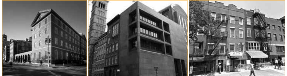
NYU's Vanderbilt Hall (l.) and Kevorkian Center (m.), and 130-148 West Houston Street (r.), which GVSHP successfully advocated to have added to the proposed historic district.

When the City released its proposed boundaries for the “phase II” landmarking, they included by far most of what we proposed for landmark