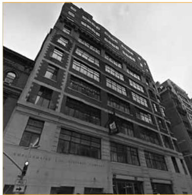
726-730 Broadway, where NYU received a zoning variance to build labs prohibited by the zoning.