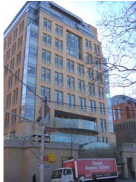
Kimmel Center (2003) 60 Washington Sq. So.