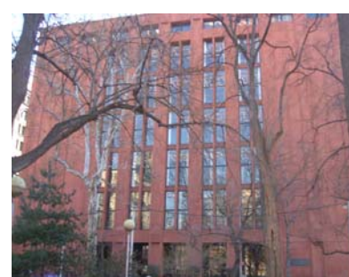
Bobst Library (1973) 70 Washington Sq. So.