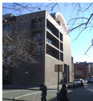
Kevorkian Center (1972) 50 Washington Square So.