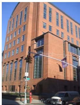
Furman Hall (2004) 79 West 3 rd Street