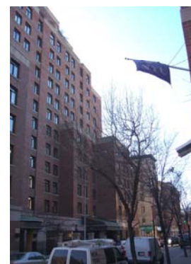
D'Agostino Hall (1986) 110 West 3 rd Street