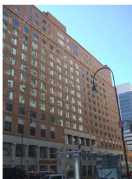
Palladium Hall (2001) 140 East 14 th Street