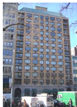
Carlyle Court (1987) 25 Union Sq. West