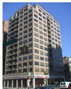
Coral Towers (2000) 129 Third Avenue