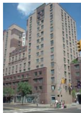
3 rd Avenue No. (1986) 75 Third Avenue