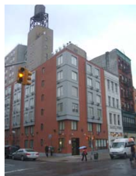
2 nd Street Dorm (2001) 1 East 2 nd Street