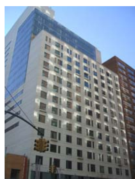
University Hall (1999) 110 East 14 th Street