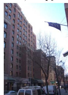
D'Agostino Hall (1986) 110 West 3 rd Street