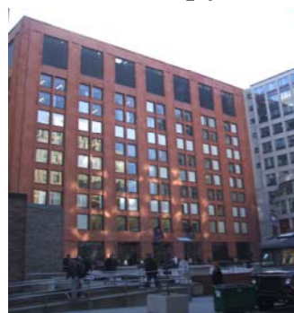
Tisch Hall (1972) 40 West 4 th Street