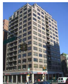
Coral Towers (2000) 129 Third Avenue