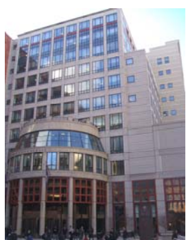
Kaufman (1999) 44 West 4 th Street