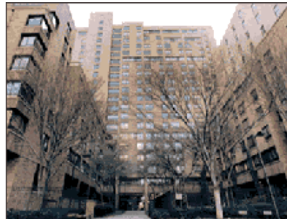
Mercer Street Residence (1981) 240 Mercer Street