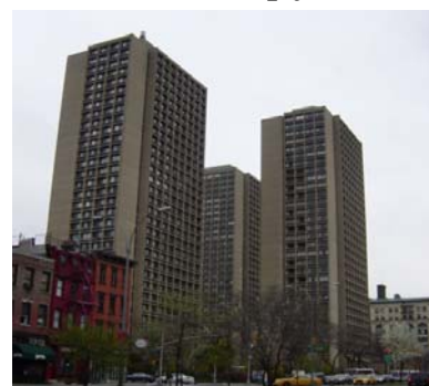
Silver Towers (2 bldgs.) (1964-7) 100 and 110 Bleecker Street

TOTAL NYU development 1964-2008 (44 years):