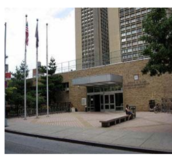
Coles Gym (1981) 181 Mercer Street