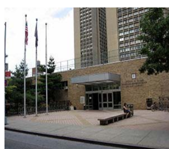
Coles Gym (1981) 181 Mercer Street