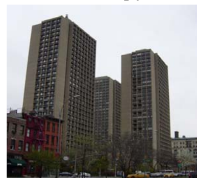
Silver Towers (2 bldgs.) (1964-7) 100 and 110 Bleecker Street

TOTAL NYU development 1964-2008 (44 years):