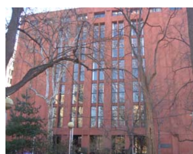
Bobst Library (1973) 70 Washington Sq. So.