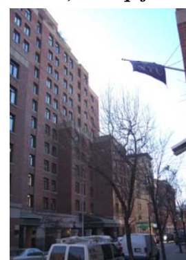
D'Agostino Hall (1986) 110 West 3 rd Street