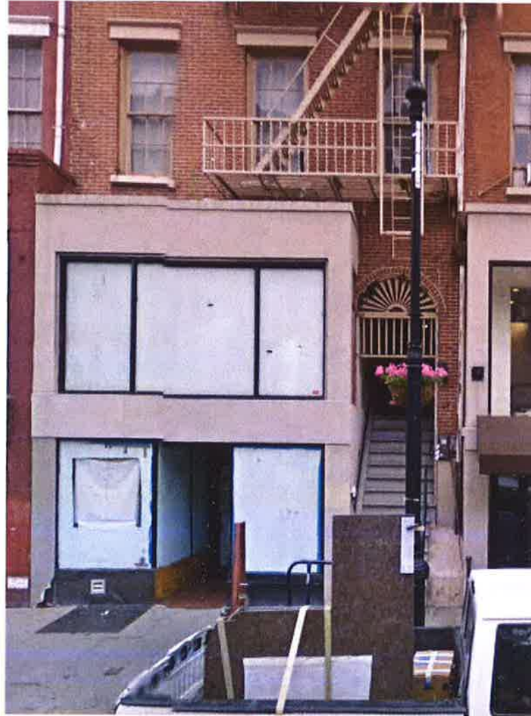
existing conditions circa 2009 view from W 8th Street