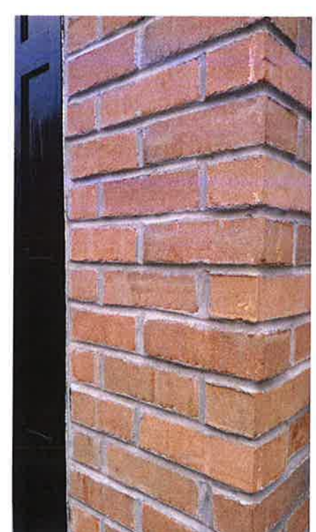
47W 8th Street - site photos