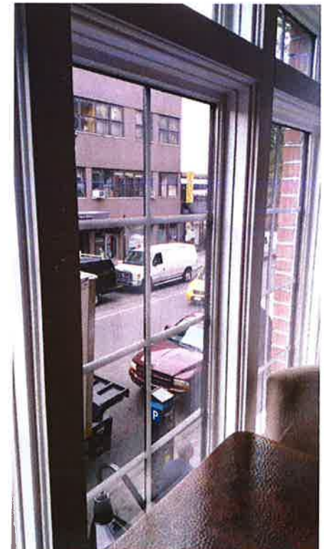
47W 8th Street - site photos