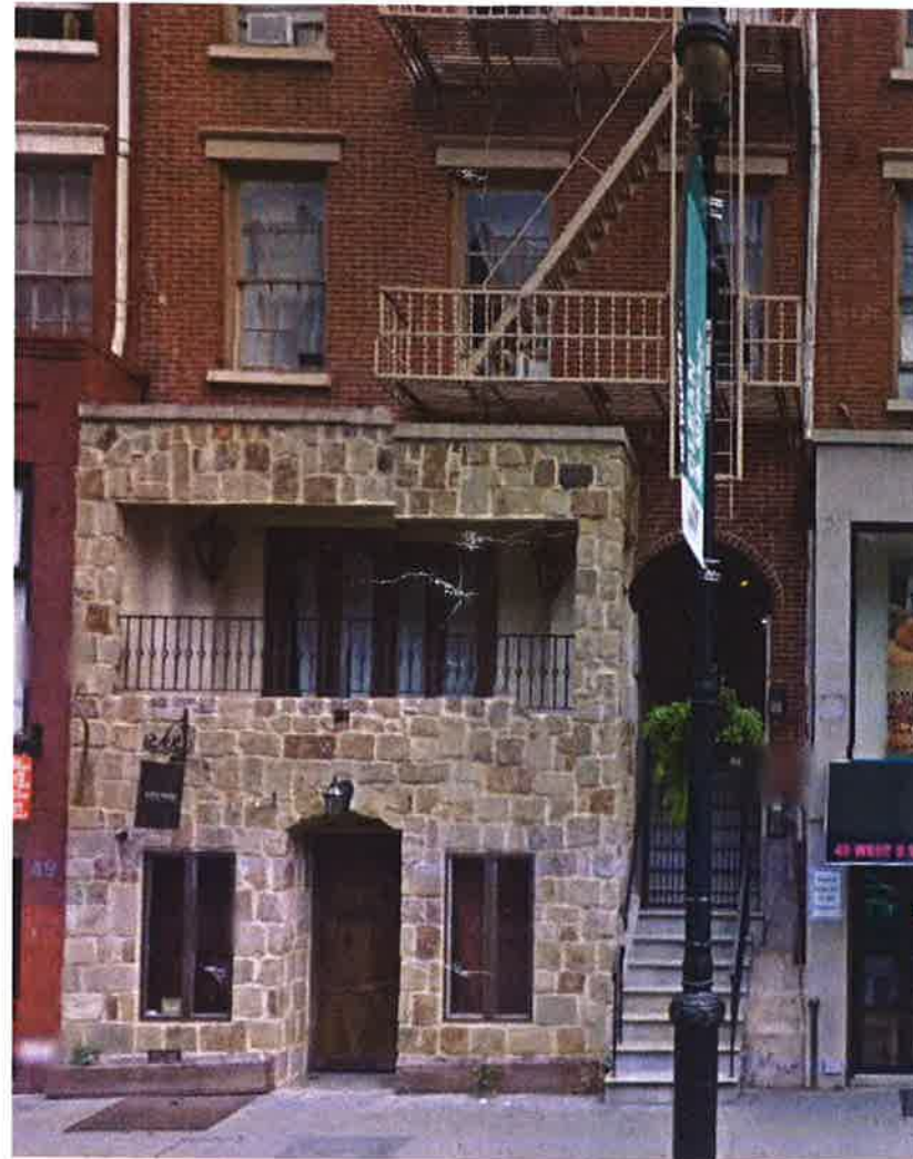
existing conditions circa 2012 view from W 8th Street