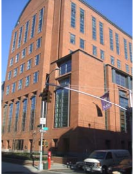
Furman Hall (2004) 79 West 3 rd Street