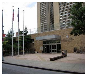
Coles Gym (1981) 181 Mercer Street