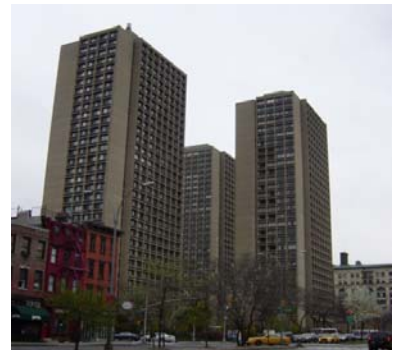
Silver Towers (2 bldgs.) (1964-7) 100 and 110 Bleecker Street

TOTAL NYU development 1964-2008 (44 years):