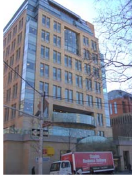
Kimmel Center (2003) 60 Washington Sq. So.