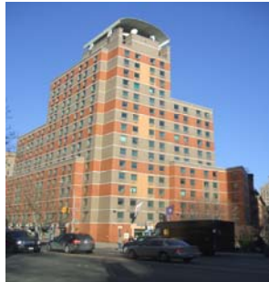
Alumni Hall (1985) 33 Third Avenue