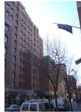
D'Agostino Hall (1986) 110 West 3 rd Street