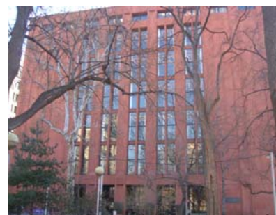
Bobst Library (1973) 70 Washington Sq. So.