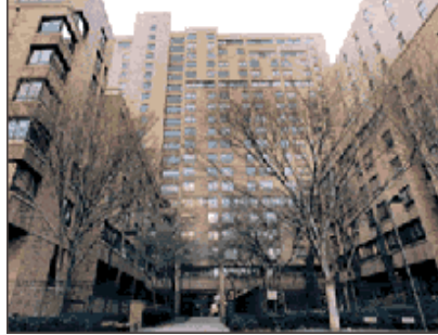
Mercer Street Residence (1981) 240 Mercer Street