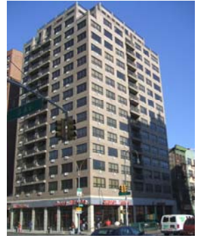
Coral Towers (2000) 129 Third Avenue