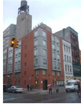
2 nd Street Dorm (2001) 1 East 2 nd Street