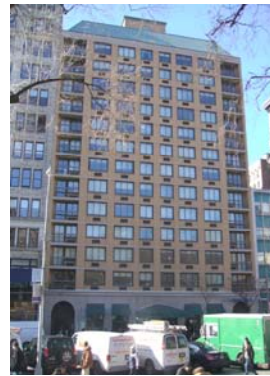
Carlyle Court (1987) 25 Union Sq. West