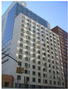
University Hall (1999) 110 East 14 th Street