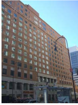
Palladium Hall (2001) 140 East 14 th Street