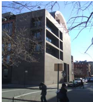
Kevorkian Center (1972) 50 Washington Square So.