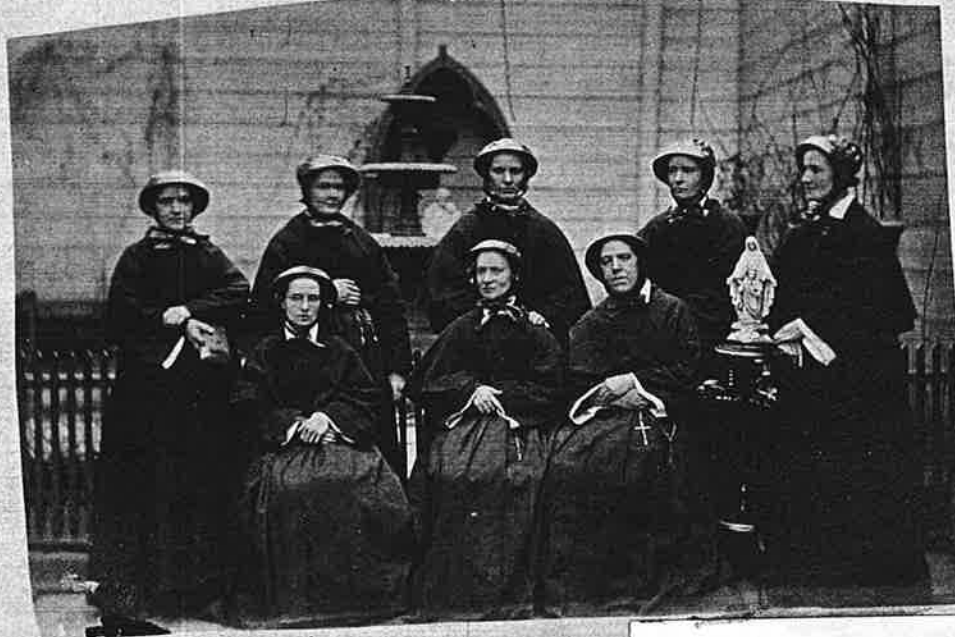
SISTERS OF ST. BRIGID'S ACADEMY